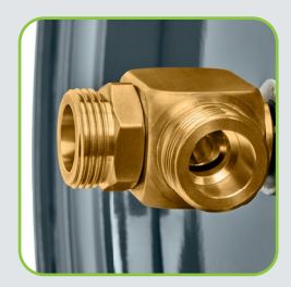
GEKA® plus angled rotary fitting with full 3/4" water flow