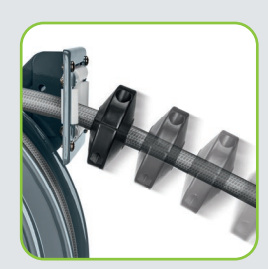
automatic roll-up of the hose