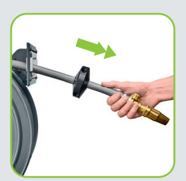
adjustment controllable by pulling the hose at its end