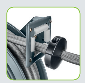
hose protecting hose guide